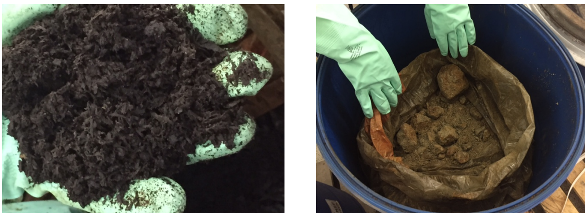
Figure 2: Samples of TENORM sludge